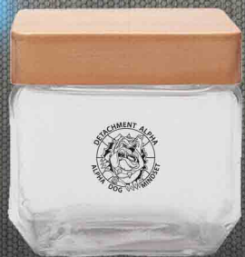
27 oz SQUARE JAR with WOODEN TOP