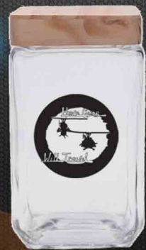
64 oz SQUARE JAR with WOODEN TOP