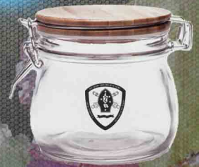
16 oz CANDY Jar with HINGED WOODEN LID