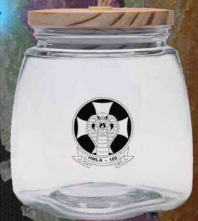
64 oz CANDY JAR with WOODEN TOP