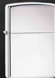
ZIPPO-HIGH POLISH CHROME 1 Location Engraving