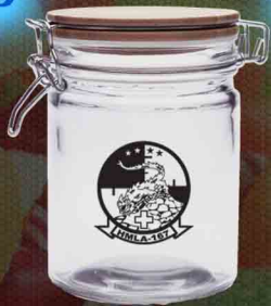
22 oz CANDY Jar with HINGED WOODEN LID