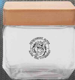
27 oz SQUARE JAR with WOODEN TOP