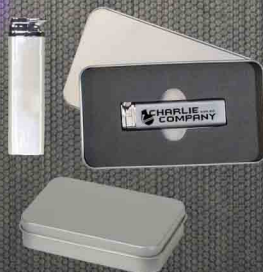
METAL LIGHTER Gift Set