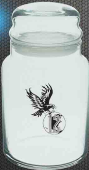
26 oz CANDY JAR with GLASS TOP