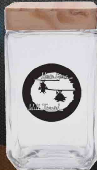
64 oz SQUARE JAR with WOODEN TOP