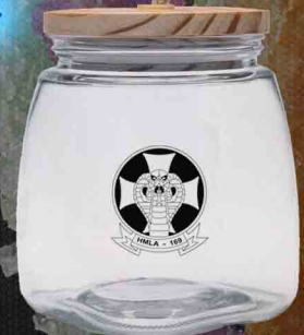
64 oz CANDY JAR with WOODEN TOP