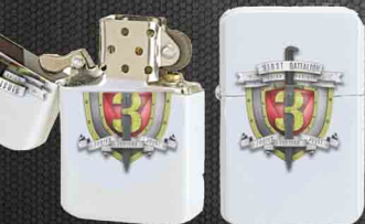
WHITE FLIPTOP LIGHTER with 4 COLOR PROCESS