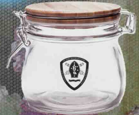
16 oz CANDY Jar with HINGED WOODEN LID