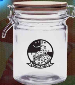
22 oz CANDY Jar with HINGED WOODEN LID