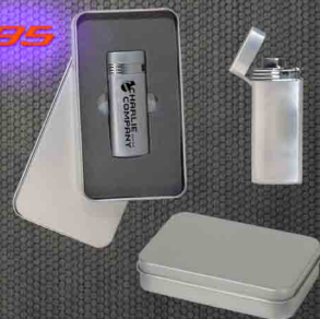
DELUXE METAL LIGHTER Gift Set