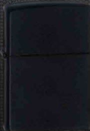
ZIPPO-BLACK MATTE 1 Location Engraving