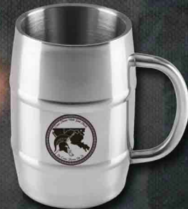
34oz JUMBO BARREL MUG