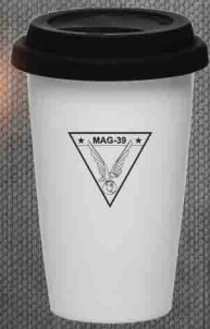
11oz DOUBLE WALL Ceramic Tumbler