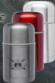
12oz FOOD/BEVERAGE THERMOS