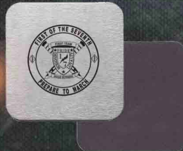
STAINLESS STEEL SQUARE COASTER W CORKED BACKING