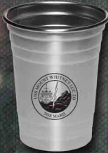
16oz STAINLESS CUP