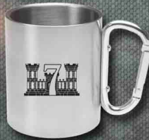
10oz STAINLESS CARABINER HANDLE