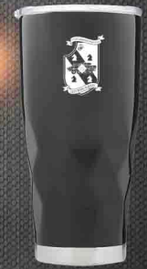
20oz STAINLESS TRAVEL TUMBLER