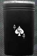
12oz STAINLESS TRAVEL TUMBLER