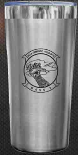
16oz STAINLESS STEEL BRUSHED FINISH