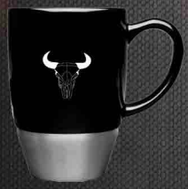
16oz CERAMIC MUG W/STEEL BASE