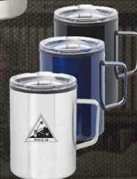
16oz. STAINLESS STEEL CAMPER MUG