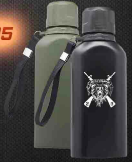
23oz TACTICAL STAINLESS CANTEEN