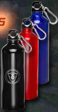
24oz ALUMINUM WATER BOTTLE