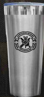
32oz. LARGE SORRENTO