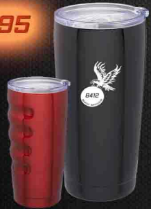
16oz FINGER GRIP STAINLESS TUMBLER